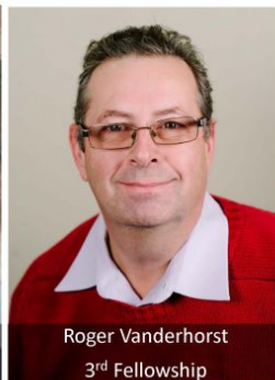
Roger Vanderhorst 3rd Fellowship